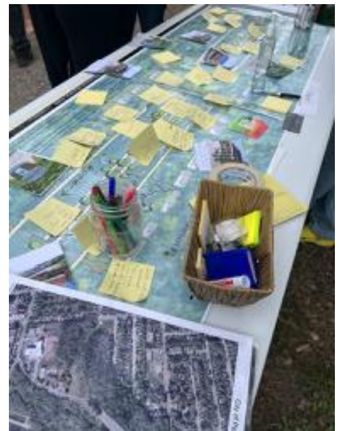
AMSG’s engagement table at the 2025 Annual East City Yard Sale garnered many comments and ideas for Ashburnham Memorial Park.

AMSG is dedicated to realizing Ashburnham Memorial Park’s much needed renewal.